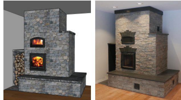
RENDERING TO REALITY