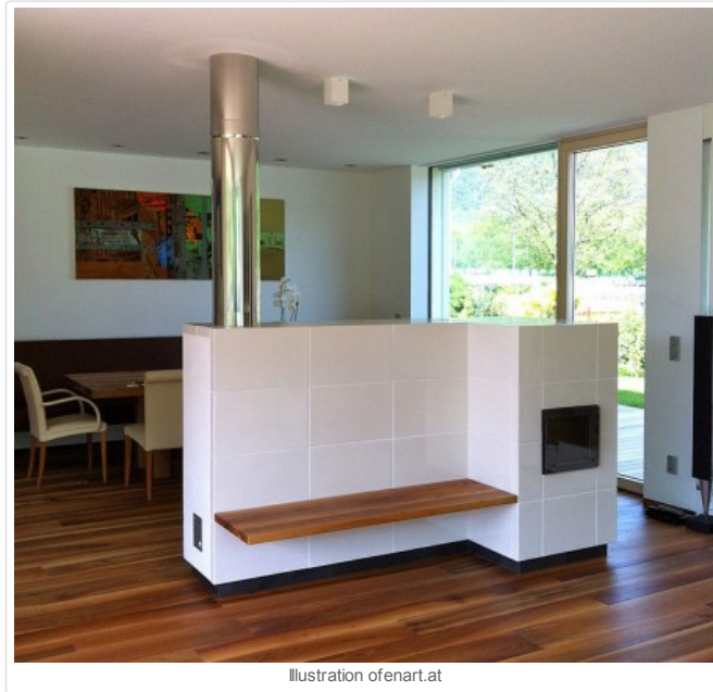
Illustration of enart.at

- The tile stove healthy, minimal air movement generating radiant heat source. Because it emits infrared rays are not directly in the air is heated, but the furnishing, interior wall surfaces, and the people staying in the same room with him, feeling the heat it provides very nice. Austria Passive houses are often built as extreme cold can compensate for the ventilation system built on air-to-air heat pump efficiency is decreasing, and the outside cold to incoming residents can hide in a frozen solid surface to warm. In the case of passive houses typical air heating in the apartment would not be so melegedőhely. stove in countries with high levels of culture have so commercialized that the house will not be home until the stove does not migrate into the family of the fire.