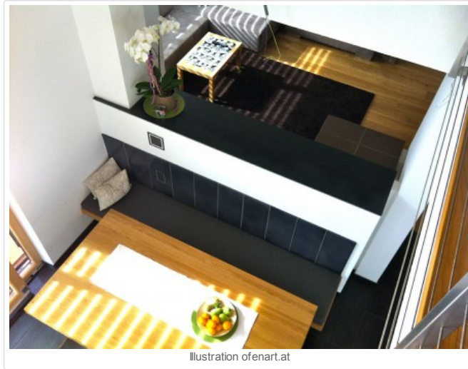
Illustration of enart.at

- The tile stove healthy, minimal air movement generating radiant heat source. Because it emits infrared rays are not directly in the air is heated, but the furnishing, interior wall surfaces, and the people staying in the same room with him, feeling the heat it provides very nice. Austria Passive houses are often built as extreme cold can compensate for the ventilation system built on air-to-air heat pump efficiency is decreasing, and the outside cold to incoming residents can hide in a frozen solid surface to warm. In the case of passive houses typical air heating in the apartment would not be so melegedőhely. stove in countries with high levels of culture have so commercialized that the house will not be home until the stove does not migrate into the family of the fire.