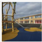
English Passive House Schools