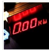
Hungarian active home energy consumption data